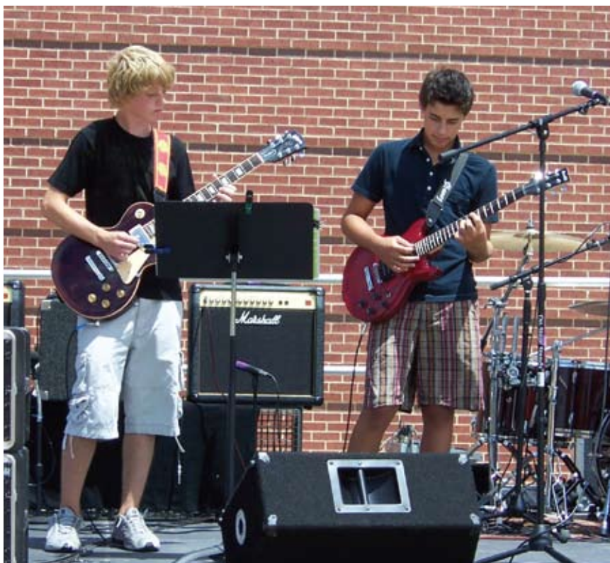
Day RockerZ performance